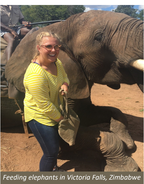
Feeding elephants in Victoria Falls, Zimbabwe

My semester in Cape Town was also full of adventures and fun times. I was able to travel to Zimbabwe and Zambia to see Victoria Falls, go on safari in Chobe National Park in Botswana, and see the highest dune in the world in the Namib Desert in Namibia.